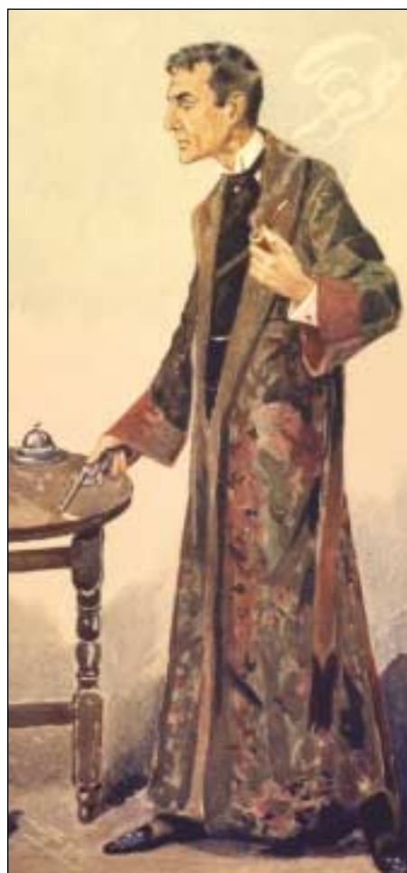
Illustration: 'Spy' [Leslie Ward]. "Sherlock Holmes" (as portrayed by William Gillette). Vanity Fair Supplement , 1907. This illustration is on display as part of the Footprints of the Hound exhibit at the Toronto Reference Library, 789 Yonge Street until December 2.

Next Meeting: Monday, November 19, 2001 – Council Room #2, City Hall