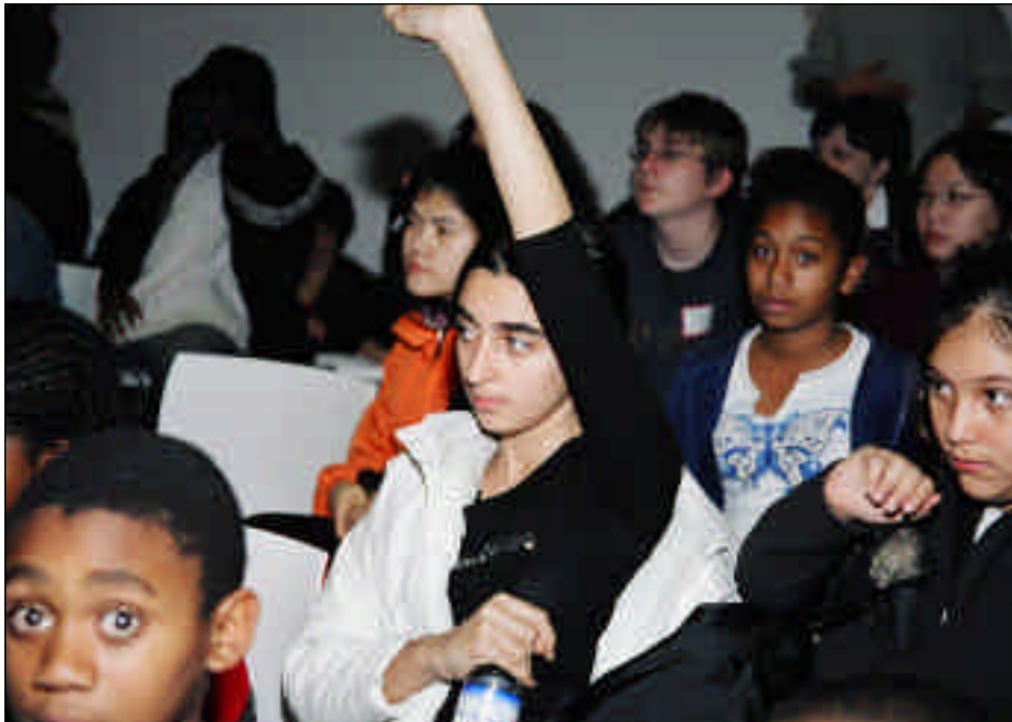
The suggestions put forward at the youth forum will go toward fashioning Toronto Public Library's new strategic plan, scheduled for release this coming spring.