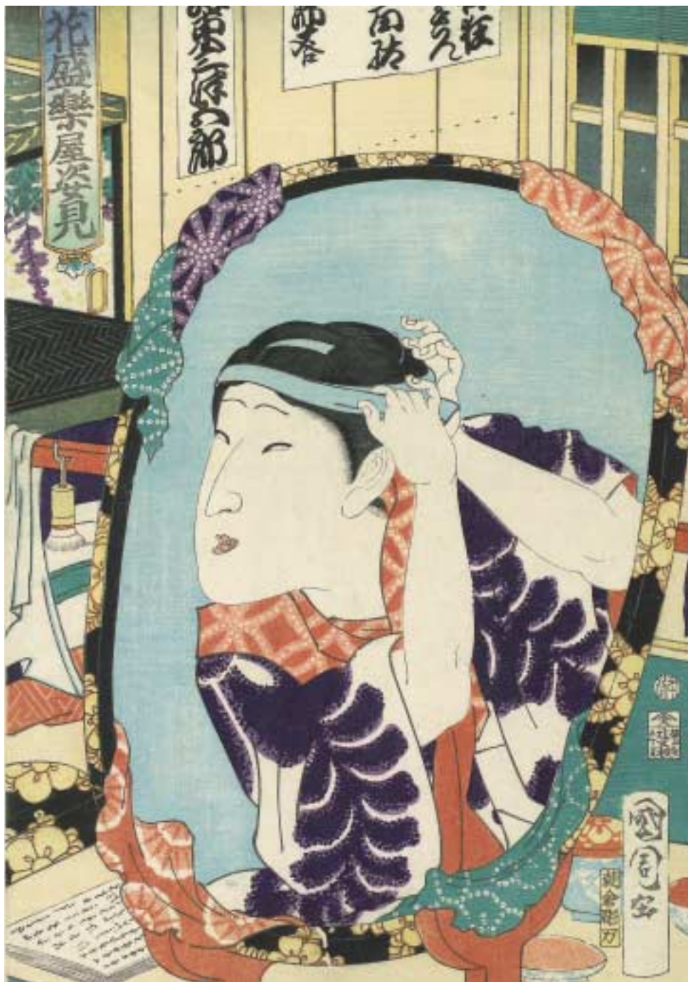
Toyohara Kunichika (1835-1900) The Greenroom . Wood block print. Toronto Public Library