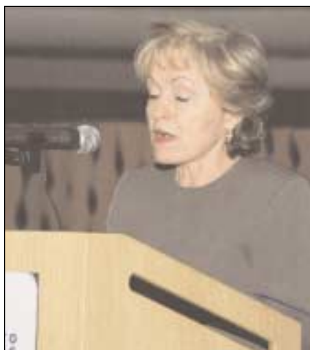
Minister of Culture The Honourable Madeleine Meilleur announces the nominees for the Trillium Awards at the Toronto Reference Library

Named Toronto's first Poet Laureate in 2001, Dennis Lee is the critically acclaimed author of numerous award-winning books of poetry for adults and children. Co-founder of the House of Anansi and former poetry editor for McClelland and Stewart, Lee received the Governor General's Award for poetry in 1972 and the Vicky Metcalf Award for a body of work for children in 1986. Some of his well-loved titles include Alligator Pie , Jelly Belly , Garbage Delight and Bubblegum Delicious .