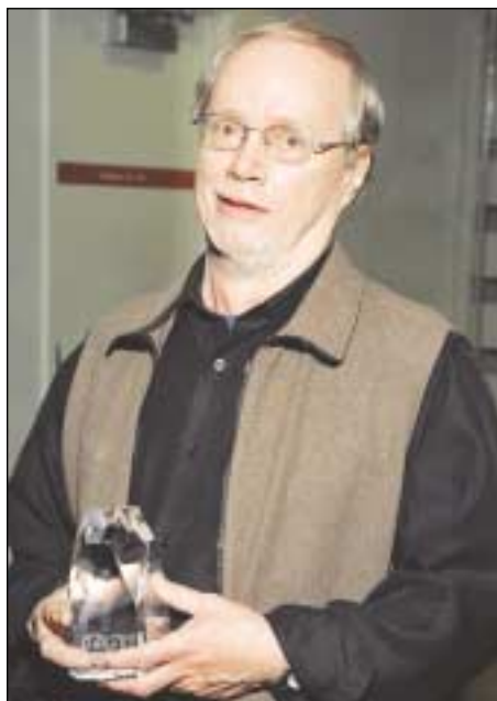
Toronto Public Library Celebrates Reading Award winner Dennis Lee