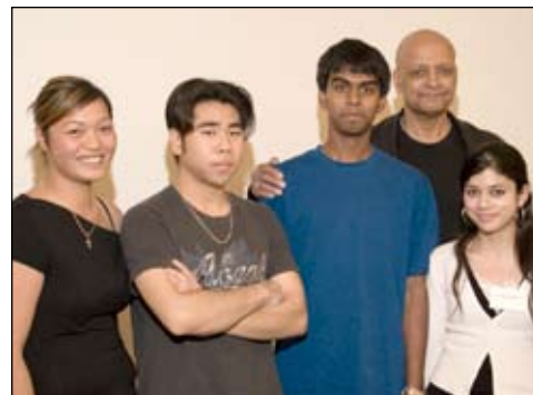
Kids@Computers staff and volunteers with radio personality Spider Jones, second from right.