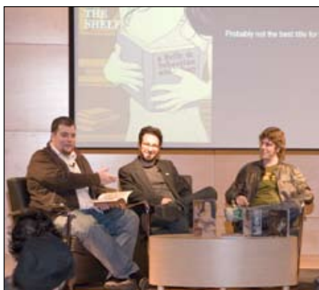
The talk show set-up of the Graphic Novel Cabaret – hosted by The Beguiling – provided for a lively and educational discussion.