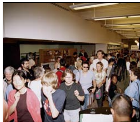
Opening day crowds took 20 minutes to file in.