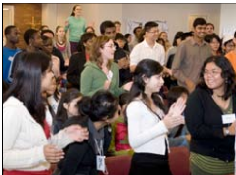
Youth volunteers give a standing ovation during the Free the Children presentation.