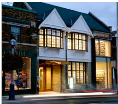
Fully accessible, completely redesigned space and new street level entrance.

Exterior of Pape Branch