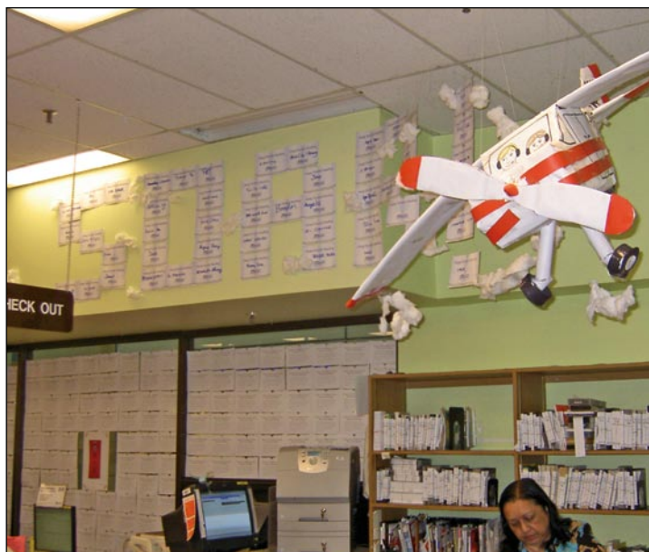
Toonie Campaign soars at Woodside Square branch.

The "I Keep Toronto Reading" fundraising campaign has raised over $50,000 to help the Toronto Public Library Foundation support the Library's literacy initiatives. Known affectionately as the Toonies Campaign — because members of the public are asked for a donation of a toonie or more — the campaign helped raise funds and awareness for the Library Foundation during the month of February. Thanks to all the staff and public who made this campaign a success.