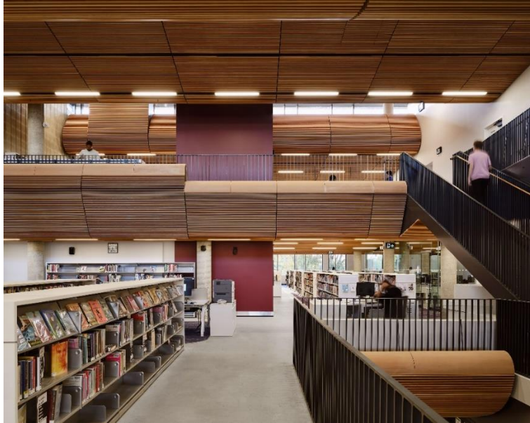
The renovated Albert Campbell District branch.

The Ontario Association of Architects (OAA) announced Albert Campbell District branch as a winner of its 2024 Design Excellence Awards. Winning projects were carefully evaluated based on criteria including creativity, context, sustainability, good design/good business and legacy.