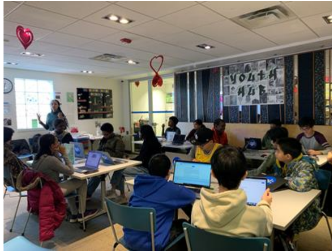
Teens learning how to create and develop functional apps at the Build Your Own Mobile App workshop held at Kennedy/Eglinton branch.

TPL, in partnership with CryptoChicks , ran March Break programs for teens at Kennedy/Eglinton, Parkdale and Woodside Square branches. CryptoChicks, in collaboration with the Government of Canada through Information and Communications Technology Council ( ICTC ), offered two digital literacy workshops for teens ages 13 to 17: “Build Your Own Mobile App” and “Entrepreneurship Essentials and Graphic Design.”