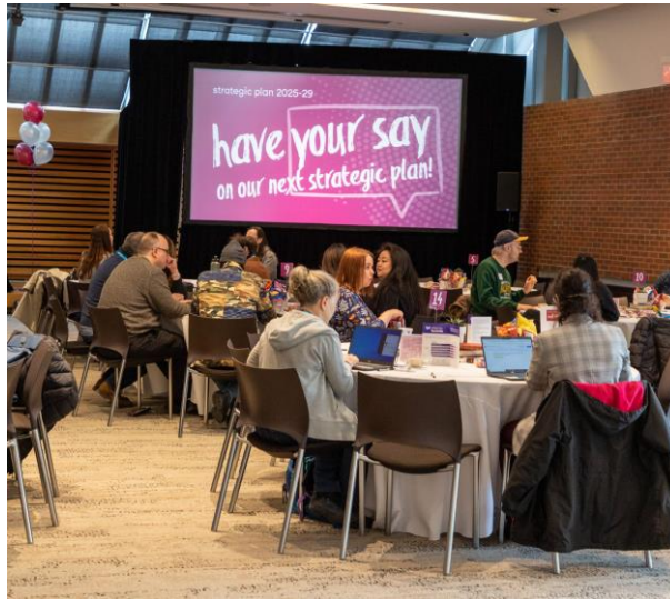
Staff gathered at a Strategic Plan Staff Consultation Forum held at Toronto Reference Library.

From February to March, Toronto Public Library hosted six Strategic Plan Staff Consultation Forums. The forums were used to gather ideas and input from library staff to help shape TPL's Strategic Plan for 2025-2029 .