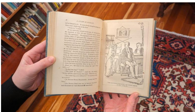
The first edition in book form of A Study in Scarlet by Arthur Conan Doyle.