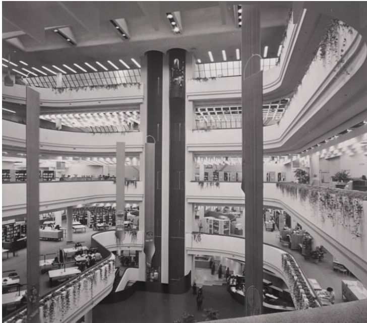
Metropolitan Toronto Library circa 1997