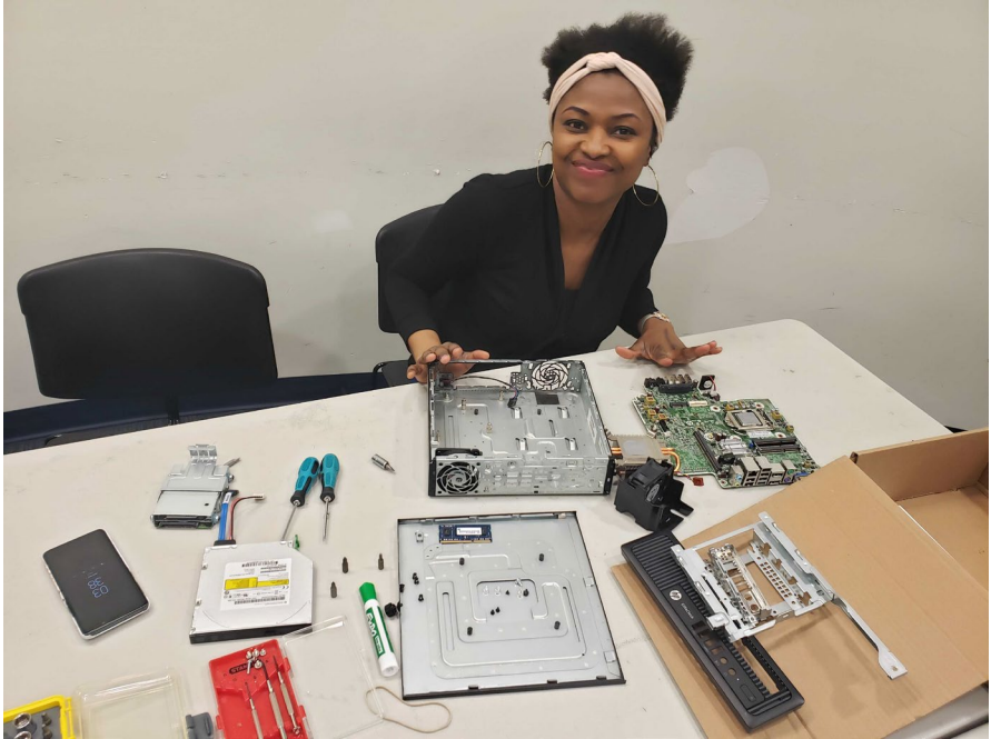
TPL: Take Apart a CPU