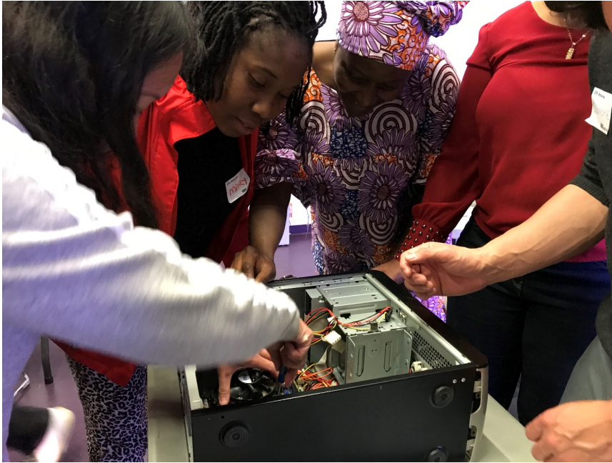
EPL: Take Apart a CPU