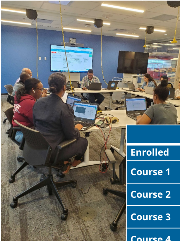
TPL: Learning Circle