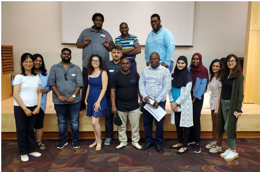
TPL Summer Social