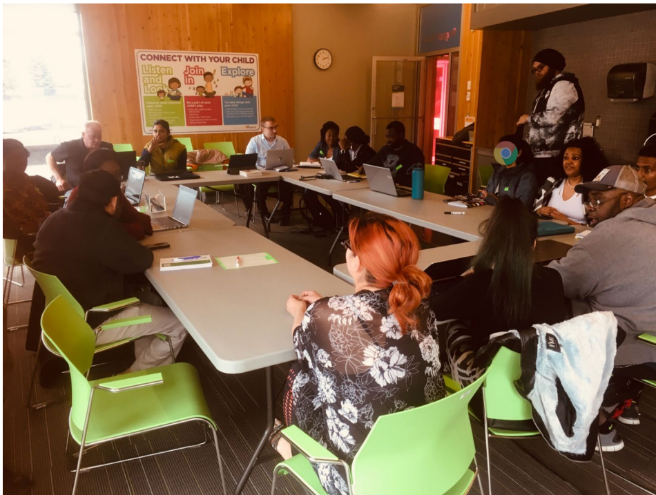
EPL: Learning Circle