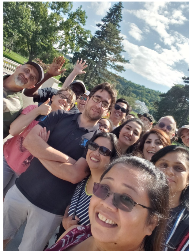
HPL: Summer Social