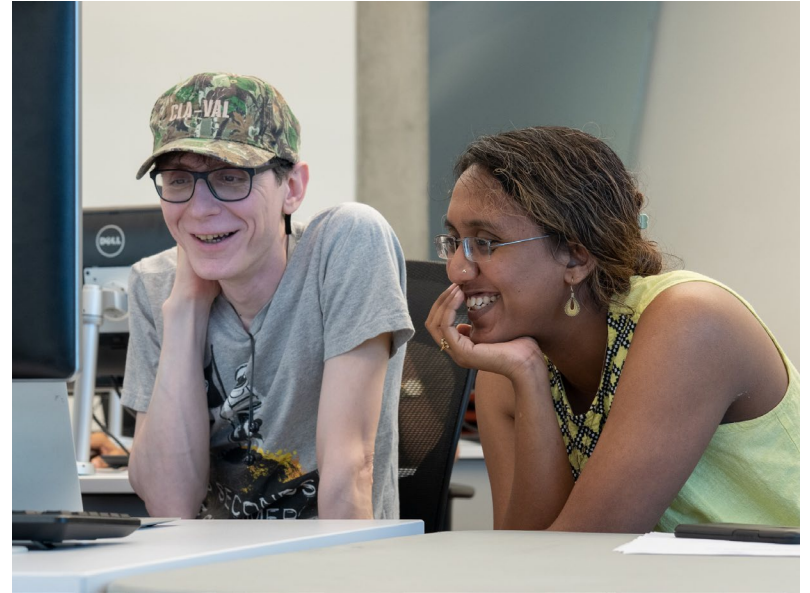
SPL: Learning Circle