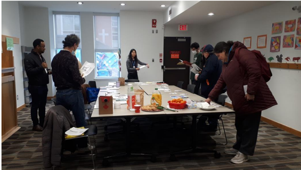
Coffee and Conversation program at Parliament Street branch on May 3, 2023.

In January 2023, Coffee and Conversation programs were reinstated at seven branches, connecting vulnerable customers to library and community resources.