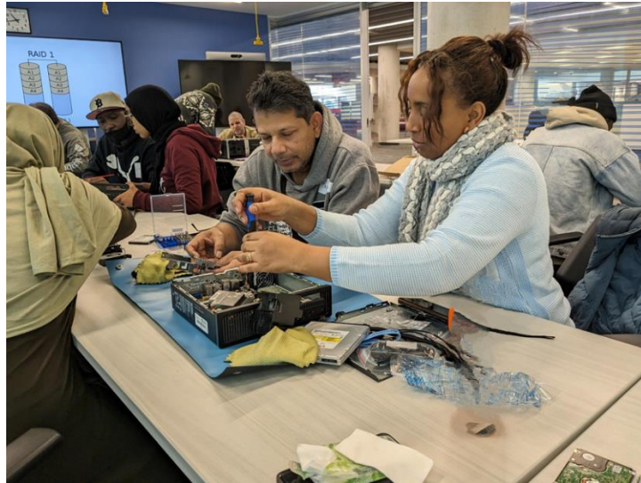
Participants working on a hands-on lab at North York Central Library.

On November 29 and 30, participants in TPL's Let's Learn Tech IT Essentials course joined a hands-on learning lab at North York Central Library, where they practiced disassembling and reassembling computer hardware to identify and learn more about their individual components. TPL's IT Services department donated old computer equipment, otherwise destined for disposal, to provide this practical learning opportunity.