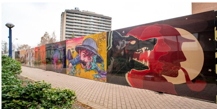
Mural installed behind Toronto Reference Library, along Sherlock Holmes Walk.

TPL is home to one of the largest research collections devoted to Arthur Conan Doyle's life and works, including his most popular creation, Sherlock Holmes.