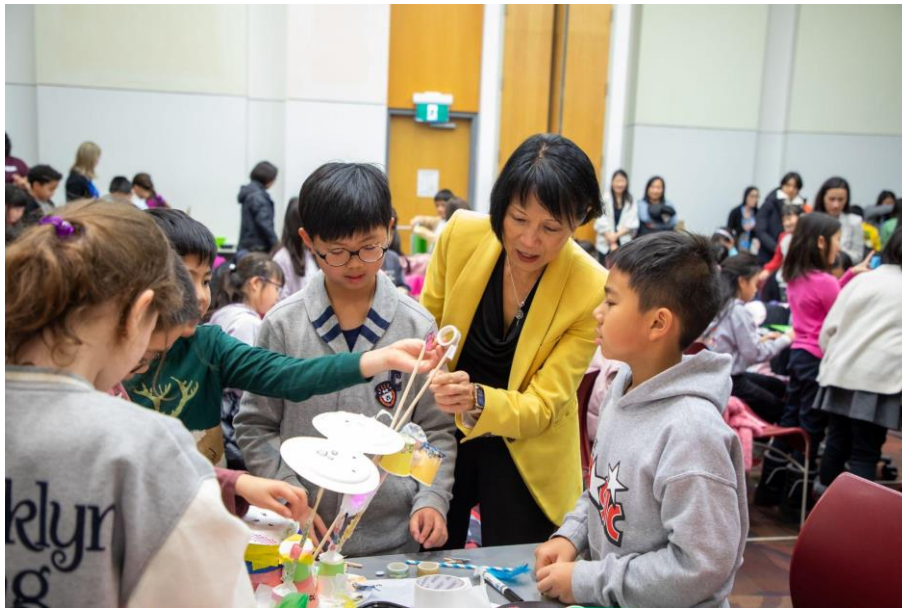
Mayor Olivia Chow with students at Kits for Kyiv held at North York Central Library on December 4, 2023.

This past fall, TPL partnered with T.G. Shevchenko Central Library for Children of Kyiv, with support from Mayor Olivia Chow's office, to design a program that could facilitate connections between children in Toronto and children in Kyiv. The collaboration resulted in Kits for Kyiv: a reinvention of the traditional pen pal exchange.