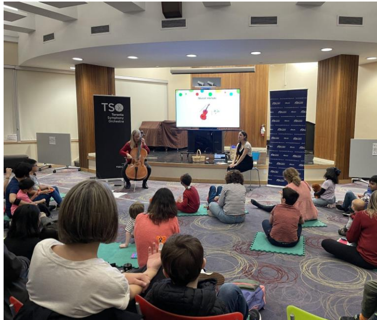
Symphony Storytime for Neurodiverse Children at S. Walter Stewart branch

Last month, Children’s Services and S. Walter Stewart branch collaborated with the Toronto Symphony Orchestra (TSO) to design and host Symphony Storytime for Neurodiverse Children, in celebration of Autism Awareness Month.