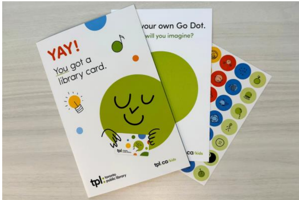
New TPL children's Welcome Package

In April, Children's Services launched a new children's Welcome Package across TPL. The package is designed to make getting a library card a fun and memorable experience for children and their parents/caregivers.