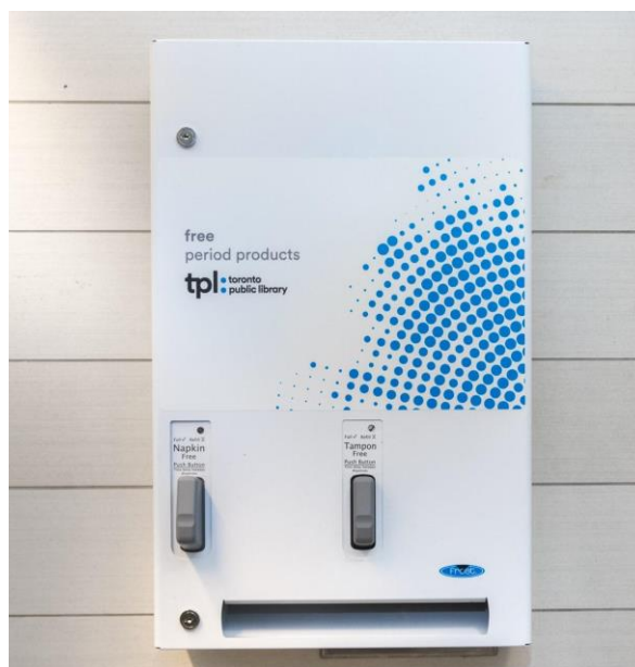
Period product dispenser in a library washroom

Earlier this year, we began offering free period products in all TPL public washrooms. Period product dispensers have been installed in each of our washrooms to address period inequity and create more welcoming and inclusive spaces in our city.