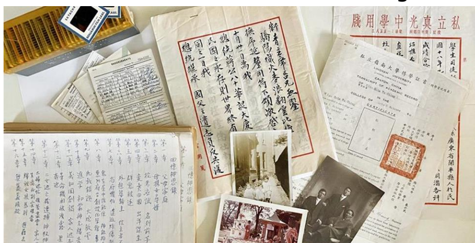
Items from the Chinese Canadian Archive

The Chinese Canadian Archive (CCA) is a community archive, maintained by TPL, to preserve and share the experiences of Chinese Canadians in the Greater Toronto Area through collected documents, photographs and other records. On May 6th, the CCA hosted two well-attended events to celebrate Asian Heritage Month.