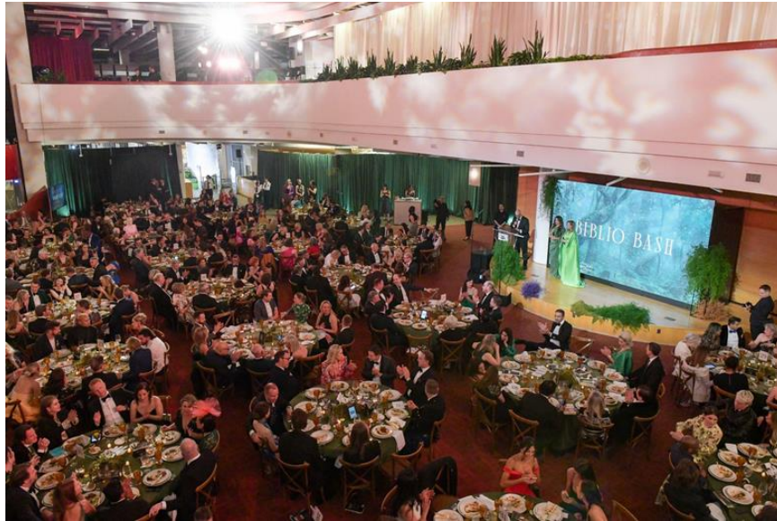
Biblio Bash gala in the atrium of Toronto Reference Library

The Toronto Public Library Foundation surpassed all fundraising records, reaching $1,071,550 in support of TPL. Presented by Fitzrovia, Biblio Bash welcomed library lovers, business leaders, philanthropists and city builders to the transformed Toronto Reference Library for an unforgettable experience. Attended by 38 notable authors and 425 guests, their sold-out black tie gala raised funds to launch new welcome resources in 40 languages and expand critical outreach for newcomer programs and services.