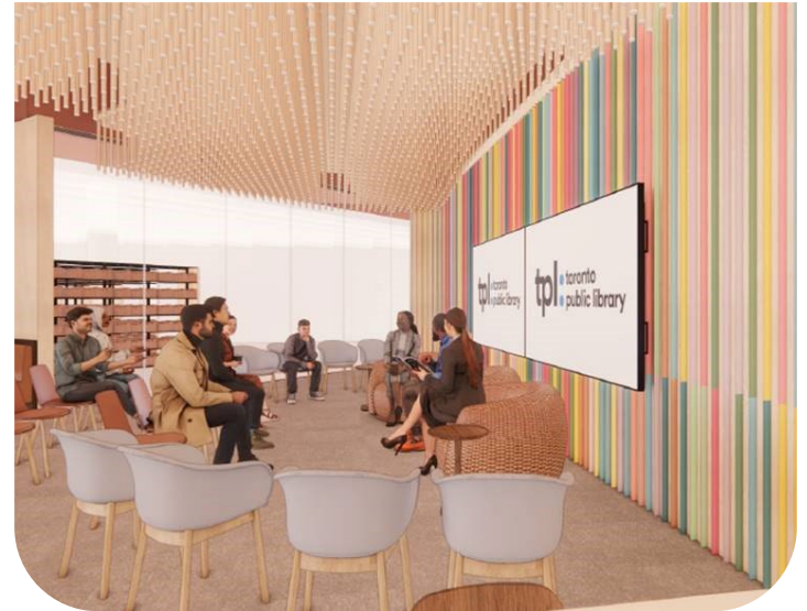
Artist rendering of the proposed TPL Centre for Democracy space at the Toronto Reference Library.